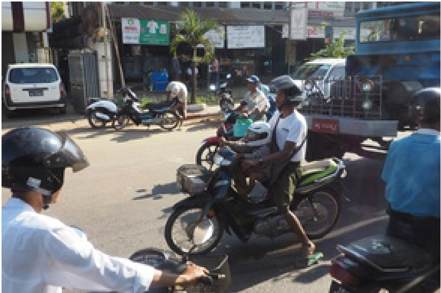
Motorcycles are a popular mode of transport in Burma