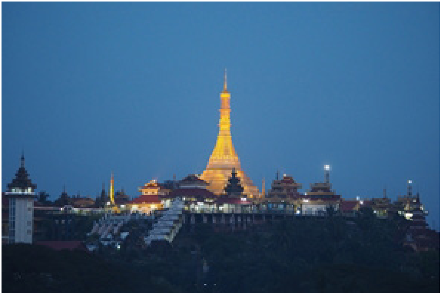
There are Buddhist monasteries in most Karen villages. About 15% of Karen people are Christians