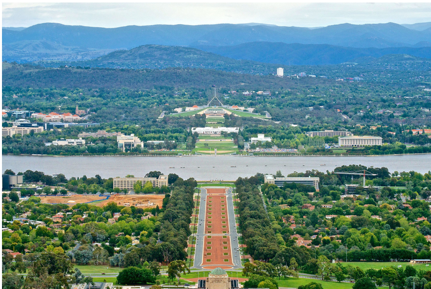
Canberra, with the old and new Parliament House in the centre