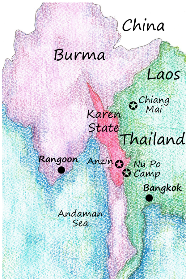
Map of Burma