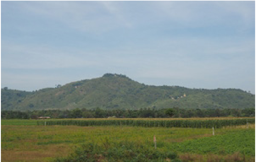
Burmese countryside